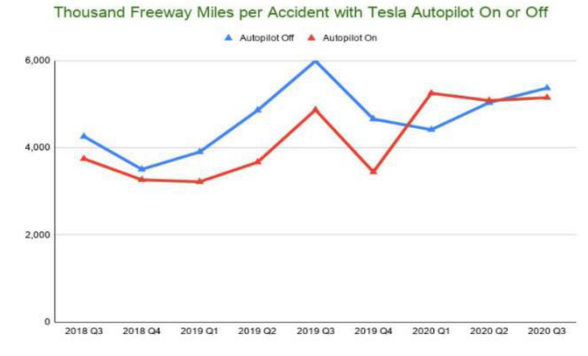
Fig. 2 Accidents when Tesla Autopilot is on

As illustrated in this graph, the number of accidents per freeway miles were quite a bit higher when the Tesla Autopilot was on, between 2018-2019. It is a common misconception that once cruise control is turned the drivers can leave the on, system unsupervised. However, this would be extremely dangerous because if the system malfunctions, coupled with high speeds on highways, can result in innumerable fatalities. First of all, ACC systems, which are the most common, do