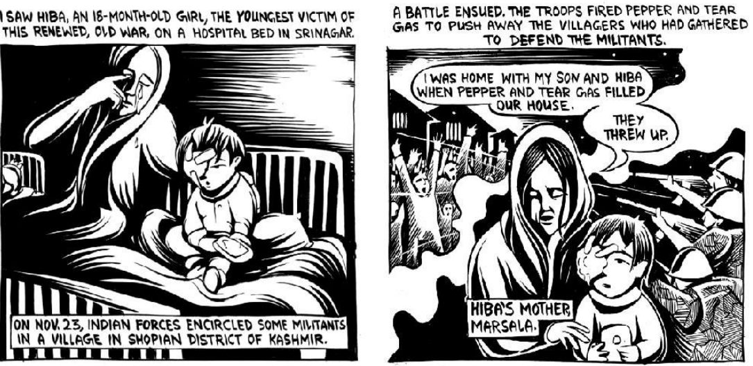
Fig. 2: Sajad, Malik. "An 18-Month-Old Victim in a Very Old Fight." Opinion: Op-Art. The New York Times, 19 Jan. 2019.

I SAW HIBA, AN IS-MONTH-OLD GIRL, THE YOUNGEST VICTIM OF THIS RENEWED, OLD WAR, ON A HOSPITAL BED IN SRINAGAR.